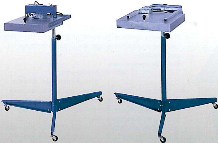
D-160 with S-60 floor stand